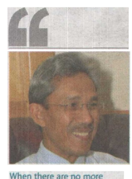
natural sources of Tongkat Ali the price is going to go up."

mand This should be an imme-diate concern to Malaysian men as Tongkat Ali has penetrated the Japanese market, bringing in about RM3.8 billion a year.