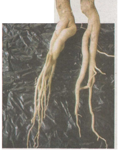
Tongkat Ali root is much sought after to cure illnesses.

The hairy roots were success-fully multiplied in solid and liquid medium. Bioactive compounds of Tongkat Ali were found in the ex-